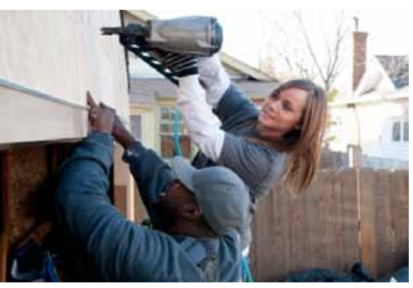
Urban HomeWorks, a Minnesota Helps grantee

Asian Media Access - $12,000 Boys and Girls Clubs of the Twin Cities -$30,435 Family Partnership - $21,600 Kwanzaa Community Church -$35,000 Minneapolis Beacons Network - $35,000 North Community YMCA -$35,000 Northside Achievement Zone - $35,000 Phyllis Wheatley Community Center - $21,400 Plymouth Christian Youth Center (PCYC) - $35,000 Shiloh International Temple - $25,908 YWCA of Minneapolis - $6,250